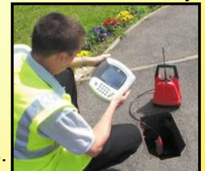
Step 2. Leak Pinpointing