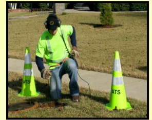
Step 1. Leak Detection