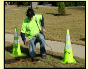
Step 1. Leak Detection