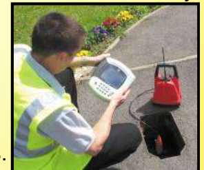
Step 2. Leak Pinpointing